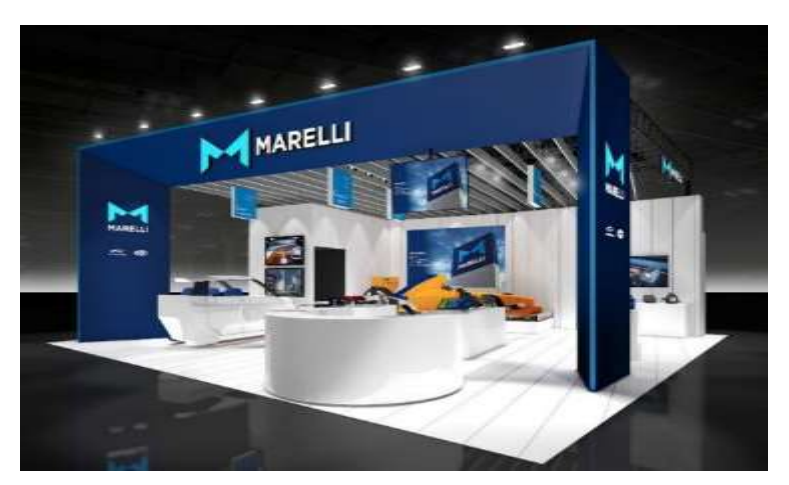
< Conceptual image of booth *Subject to change without notice. >

We look forward to welcoming you at the MARELLI booth and showing you the cutting-edge technologies and products that we can deliver as a unique, tier-one supplier with a global network.