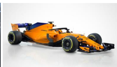
<Formula One car's image for illustration purposes>