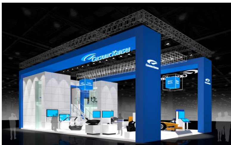
<Exhibit booth’s image for illustration purposes (*subject to change without notice)>

Chinese: https://www.calsonickansei.co.jp/cn/exhibition/201904/