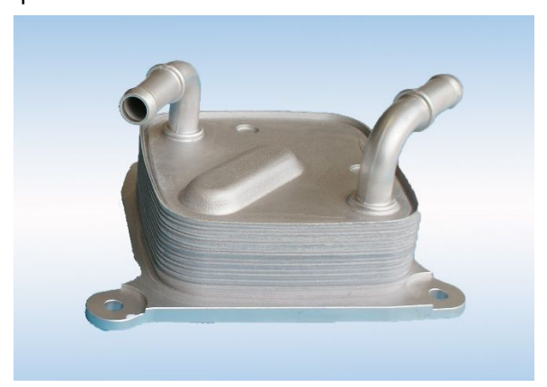
New model LP-BOC

Calsonic Kansei has been producing BOCs for about 20 years, and added the small-size, lightweight circular \phi 85 to its product series in 2011. In recent years, to further improve engine room layout so as to meet the wide ranging needs of our customers, Calsonic Kansei added the square-type LP-BOC, which retains equivalent performance at half the height of previous models, to its product series.